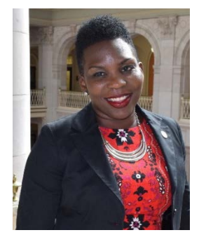
A Message from the Office of Community Engagement