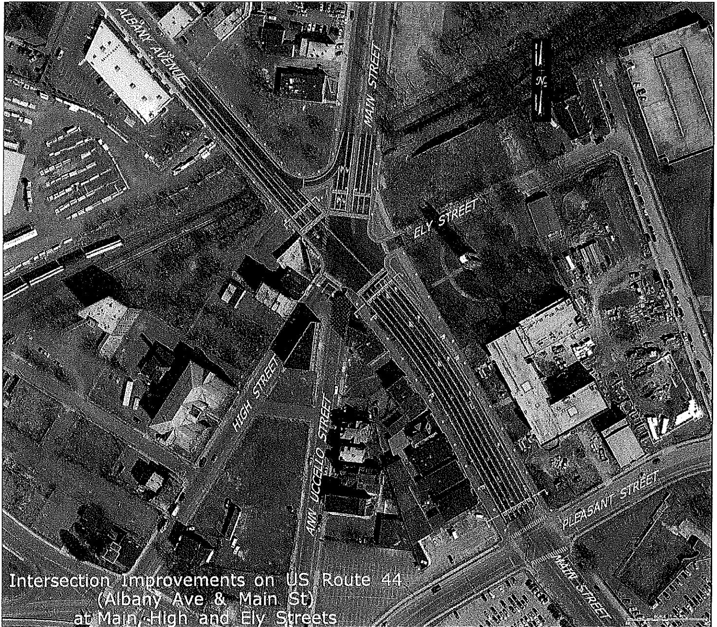
Intersection Improvements on US Route 44 (Albany Ave & Main St) at Main, High and Ely Streets