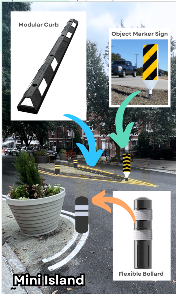
Base Image is adapted from photo taken by FHI Studio. Insert photos are sourced from: US Reflector