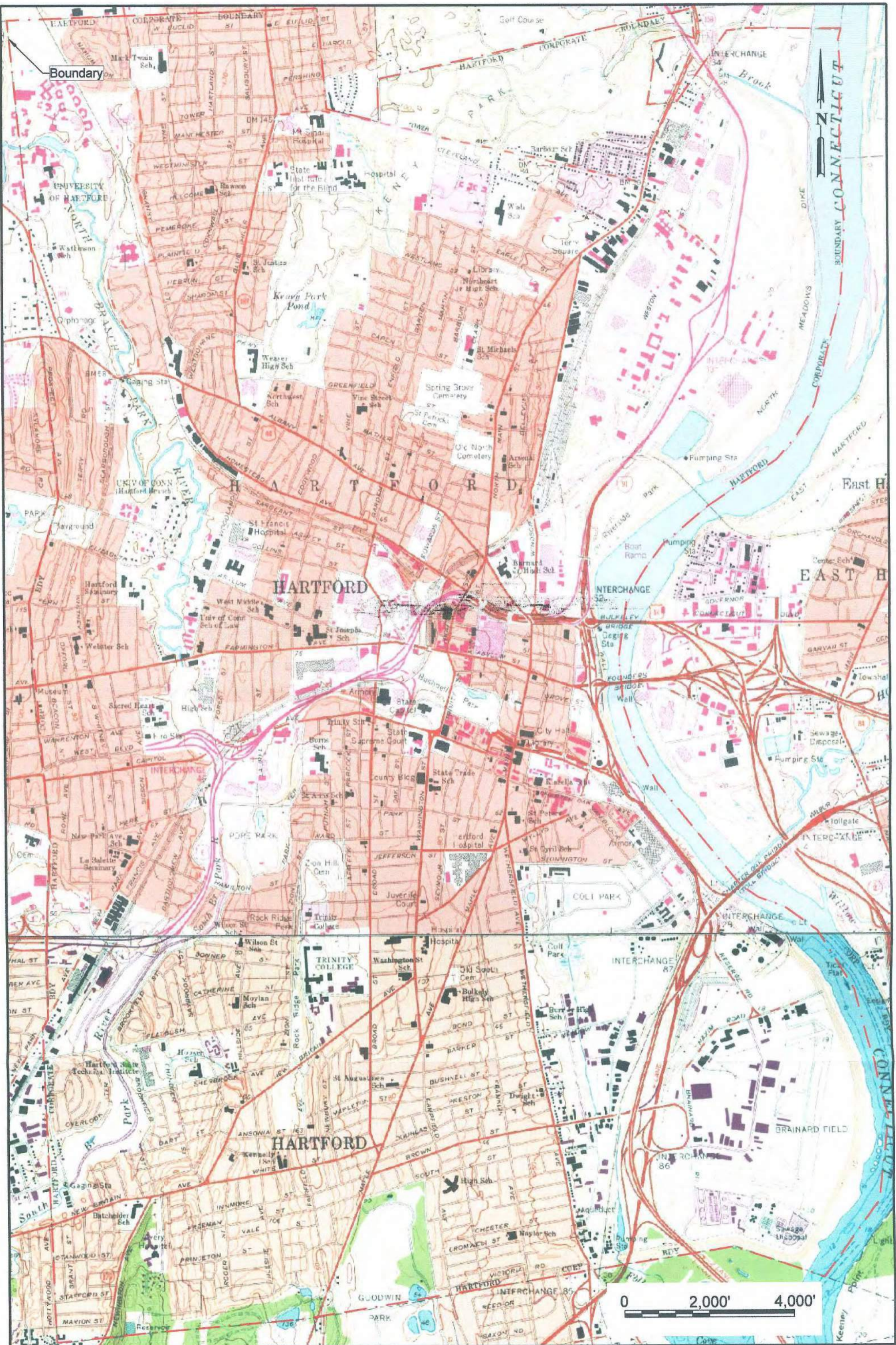
Attachment B: City of Hartford Boundary Map