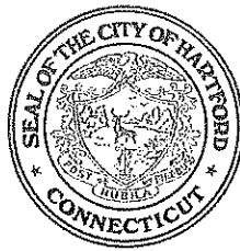
Luke A. Bronin Mayor

WHEREAS , during Labor Day weekend 2020 the City of Hartford experienced a sophisticated cyberattack, and although the potential damage and disruption was significantly minimized by the City's cyber defenses and the swift work of the MHIS team, the attack nonetheless had a significant operational impact on the city's information technology systems; and